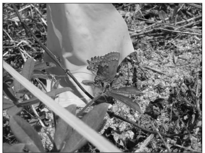
Hope for the future: A female Frosted Elfin laying eggs on Wild Lupine at the Turners Falls Airport, May 2008. The pink flag in the background indicates this plant was one transplanted in the spring of 2007.

Special Note : As with most airports in the Commonwealth in this post 9/11 world, the aircraft operating areas of the Turners Falls Municipal Airport are closed to the public.