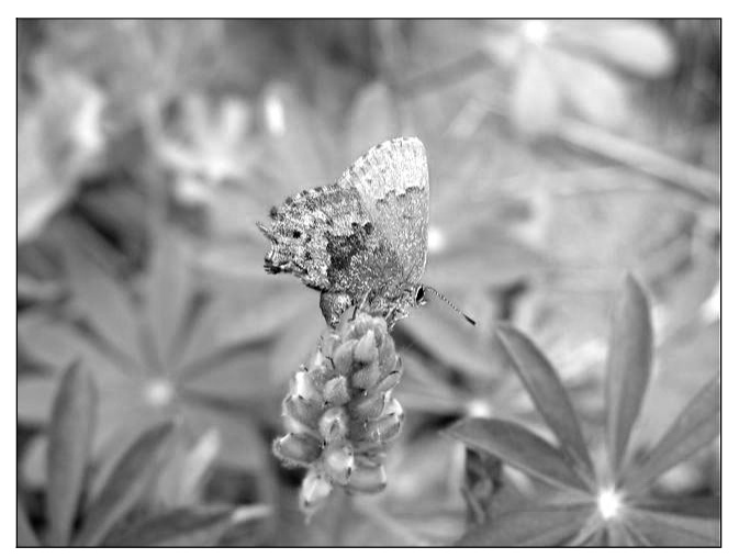
Frosted Elfin ovipositing on Lupine flower spike Albany Pine Bush 5-27-07

16 Massachusetts Butterflies No. 32, Spring 2009 © Copyright 2009 Massachusetts Butterfly Club. All rights reserved.