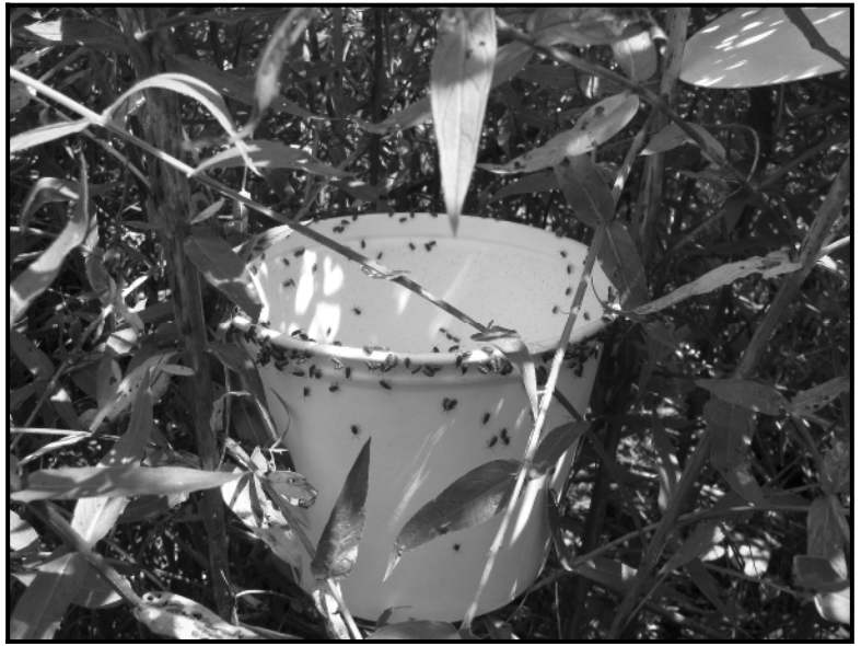
Galerucella beetles being released

<sup>6</sup> Northeast Forest and Fire Management LLC is a prescribed fire consultant instrumental in developing the plan and its implementation